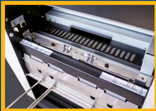
Simple-slide paper size adjustment