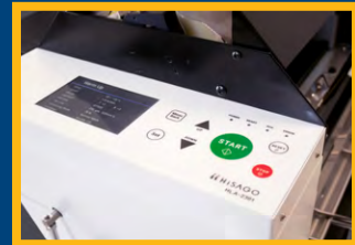
Easy-to-use Color Screen & Controls