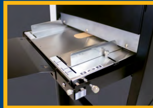
Upgraded multi-thick- ness feed tray